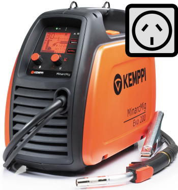
MinarcMig Evo 200 AU

Kempfi K5 MIG welder for mobile, adaptive welding in automatic and manual mode. Mains plug suitable for AU/NZ markets. The delivery package includes a MIG welding gun, cables, gas hose and shoulder strap.