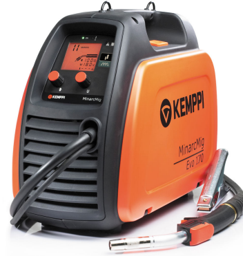
MinarcMig Evo 170

Kempfi K5 MIG welder for mobile, adaptive welding in automatic and manual mode. Mains plug suitable for AU/NZ markets. The delivery package includes a MIG welding gun, cables, gas hose and shoulder strap.