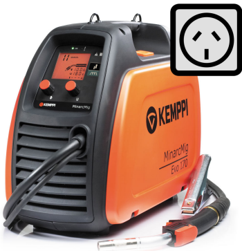
MinarcMig Evo 170 AU

Kempfi K3 MIG welder for mobile welding in manual mode with separate controls for voltage and wire feed speed. The delivery package includes a MIG welding gun, cables, gas hose, and shoulder strap. AU and DK models available.