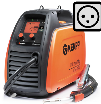
MinarcMig Evo 170 DK

The Kempfi K3 MIG welder for mobile welding in manual mode has separate controls for voltage and wire feed speed. Mains plug suitable for AU/NZ markets. The delivery package includes a MIG welding gun, cables, gas hose, and shoulder strap.