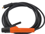
Welding cable 5 m 16 mm 2