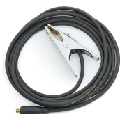
Earth return cable 5 m, 16 mm 2