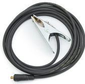
Earth return cable 5 m, 25 mm 2